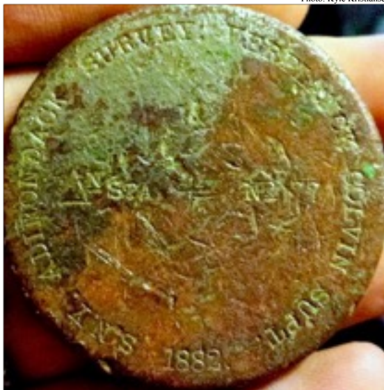
The missing Station 77 triangulation bolt from the 1882 Adirondack Survey has been found!