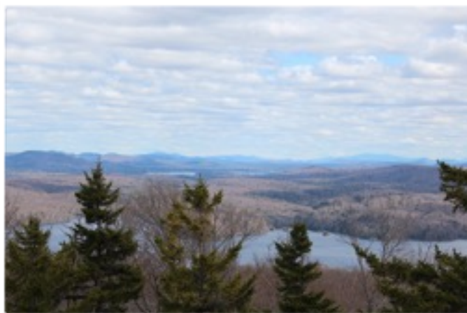
Giving hikers great views for over a hundred years!