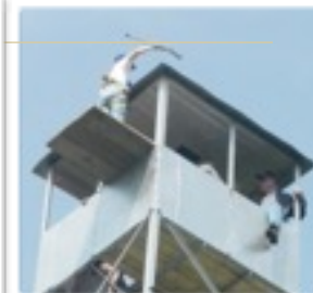
Friends of Stillwater Fire Tower volunteers making the tower