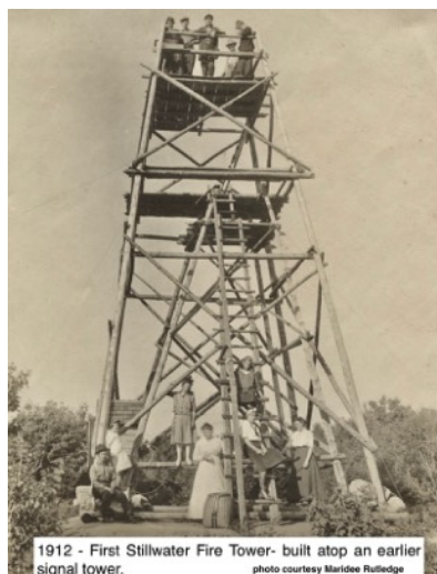
1912 - First Stillwater Fire Tower- built atop an earlier signal tower.